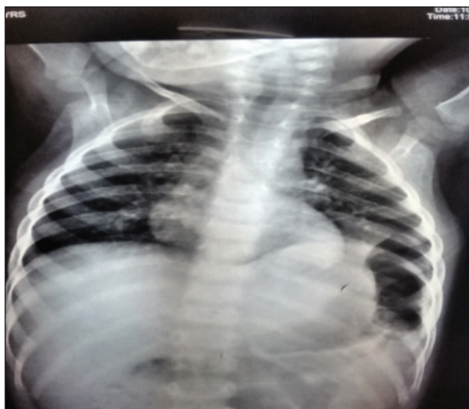
Figure 1. Chest X-ray of case 1

Both children underwent laparoscopic repair of diaphragmatic defect and discharged safely.